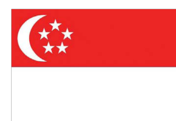
Edwin SY Chan (Cochrane Singapore)